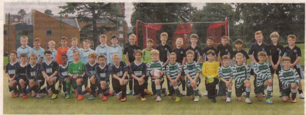
Teams from The Crescent, The Revel School, Milverton House and Our Lady's at Princethorpe College's Primary Schools' Football Festival

Teams from four primary schools: The Revel, Crescent, Milverton House from Nuneaton and Our Lady's took part in Princethorpe College's 13th Football Festival for Under 11s. Princethorpe College