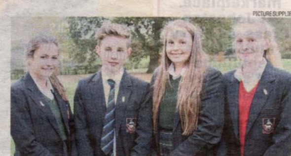
Four of the successful swimmers.

Joining a team of 30 swimmers from the college who travelled to Walsall Gala Baths to compete against 15 other regional schools, the pressure was on for national qualifying spots the minute the first whistle blew. This year saw the old style 33 metre pool blocked off to create standardised 25 metre lengths, making the distance commensurate with