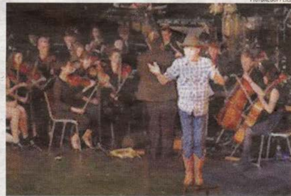
Performing on stage.

Taking part in the performance was magical