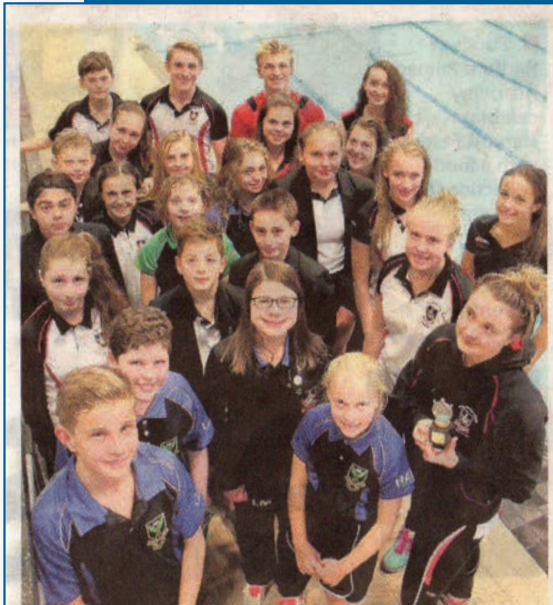
Victorious Princethorpe College swimmers