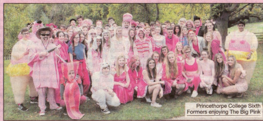
Princethorpe College Sixth Formers enjoying The Big Pink