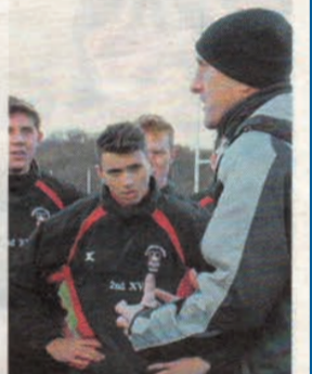
Will Greenwood on the training pitch with Princethorpe College rugby players.

England World Cup winner Will Greenwood was at Princethorpe College to put 40 players through their paces at a mid-season training session.