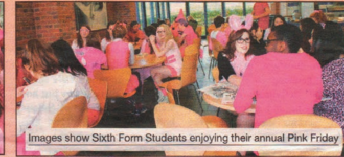
Images show Sixth Form Students enjoying their annual Pink Friday