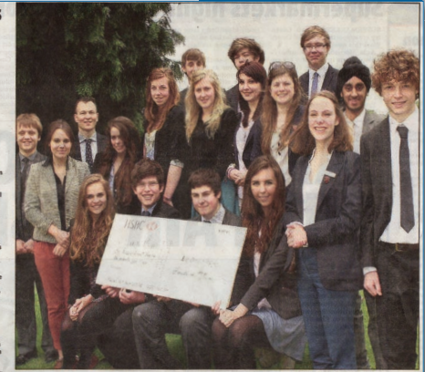
FEED THE NEEDY: Pupils from Princethorpe College who raised £6,068 for charity Mary's Meals

In 2009, the school raised £2,000 for a kitchen to be built at a school in Malawi.