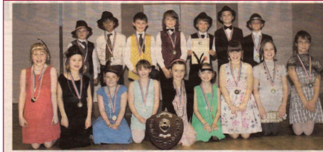
The Anniversary Shield winners, Crackley Hall's Junior 5 at the drama festival competition in Coventry. Picture submitted